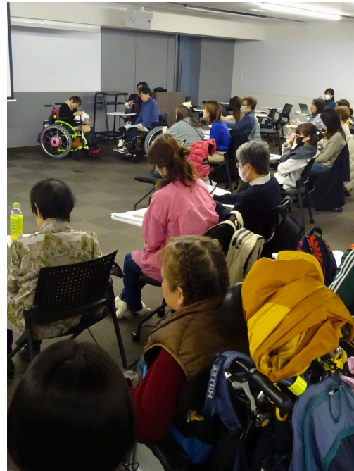
The gathering in Kyoto themed around the prevention of sexual violence.