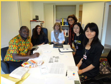
Meeting with committee member of CEDAW/2016

The concluding observations by UN Committee on the Rights of Persons with Disabilities (CRPD) issued at the 2022 review of Japan pointed out the need to eliminate multiple discrimination against women with disabilities in many areas of their social lives.